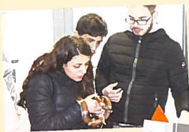
Italian studygroup visits Clusius College Alkmaar