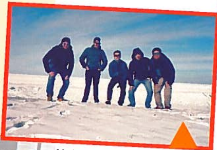
Nederlandse studenten in Amerika