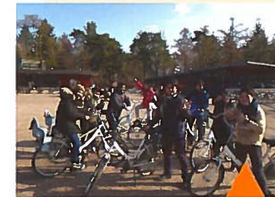
Japanese group at Kroller Muller museum