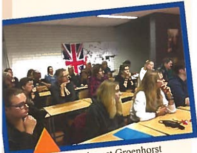
Orientatie bijeenkomst Groenhorst