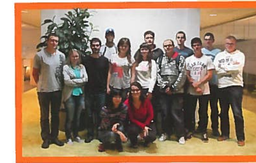
Introductory meeting July