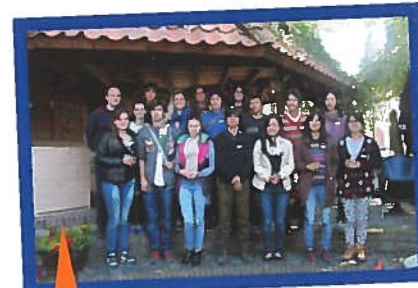
Midpoint meeting Aalten