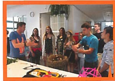
Midpoint Alkmaar, visit to Clusius College